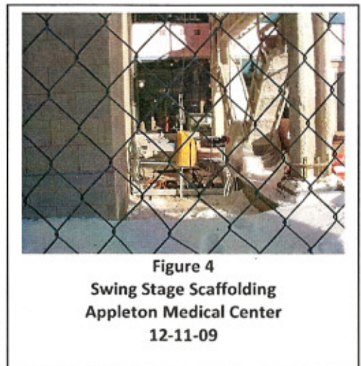
Figure 4 Swing Stage Scaffolding Appleton Medical Center 12-11-09