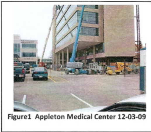
Figure1 Appleton Medical Center 12-03-09