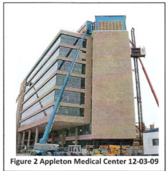
Figure 2 Appleton Medical Center 12-03-09